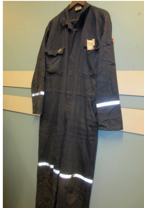
Figure 5: A miner's work suit ( lompen) hanging near the entrance to mine 3. Note the reflective bars on the suit to facilitate seeing fellow miners in the depths (and darkness) of the mine.