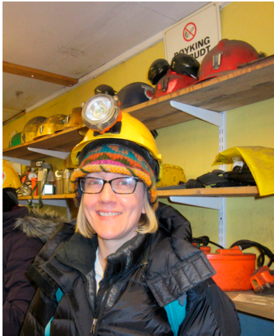
Figure 6: The author in the “tool room” of former mine 3, now a tourist destination. This room includes many of the different kinds of tools Longyearbyen miners have used over the past century. All tour attendees were given hard hats with headlamps before we descended into the mine. Later, some attendees donned lompén.

polar night beyond town by dog sled or snowmobile, 42 although the skyglow of Longyearbyen reaches far beyond town borders. 43 The striking light/dark cycle of the high Arctic –when these “cycles” are in fact mutually exclusive seasons, each lasting for months at a time– is therefore central to both summer and winter tourism. While some tourist economies suffer during the off-season –for instance, ski resorts seeking to recruit summer hikers and mountain bikers– the attraction of Longyearbyen is less seasonal and