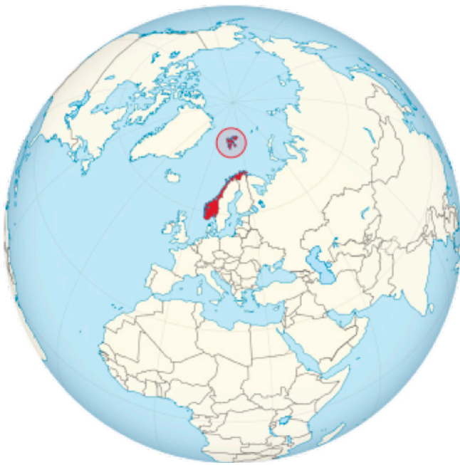
Figure 1: Map showing Norway (in red) and Svalbard (the archipelago colored red within the circle). This view particularly shows the latter's proximity to the North Pole.