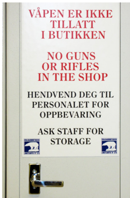
Figure 4: Gun storage locker and warning at the entrance of the supermarket in Longyearbyen.

you should not go out for walks outside the inhabited areas if you are not accompanied by someone who can carry (and fire) a rifle.” 35 Reminders of polar bears were everywhere (fig. 4). Furthermore, during the first conference dinner, some of us learned that Svalbard’s polar bears do not leave the islands and head out onto the ice in winter. Even better, the archipelago’s polar bear population (3,000) actually outnumbers its permanent human population (2,200). Does the town’s extensive artificial lighting, powered by coal, attempt to segregate its large mammals –human and otherwise?