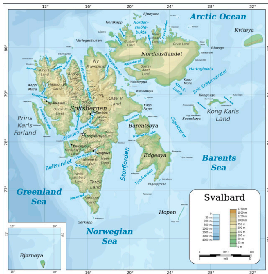
Figure 2: Topographic map of Svalbard. Longyearbyen is marked with a white star; it is located almost in the middle of Spitsbergen. Credit: Oona Räisänen. Permission is granted to copy this document under the terms of the GNU Free Documentation License. Source: Wikipedia, “Svalbard.”

change. 6 Most of my father’s fieldwork took place in big tents on the ice over several weeks. He also went out on icebreakers –rugged ships departing from Longyearbyen or Tromsø that can bust through polar ice or, in his case, lodge themselves in Arctic ice for extended periods of time. 7 Most of my father’s time “on the ice” was during the shoulder season when pack ice had built up and was close to seasonal highs, but didn’t entail the